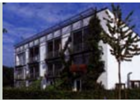
1990 Darmstadt Passivhaus, Germany The original 'Passivhaus' built to exacting super- insulation standards