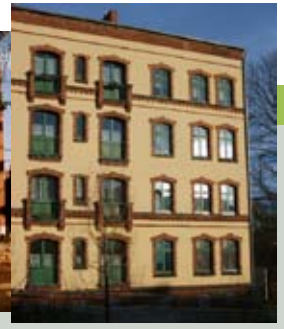
2000-2020 Building modernisation programme, Germany A national programme to reduce domestic emissions 30% by 2020