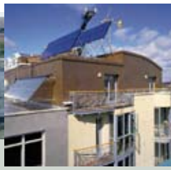
1994 'Green building', Dublin Demonstration low energy block in Temple Bar with solar and wind power and ground source heating.