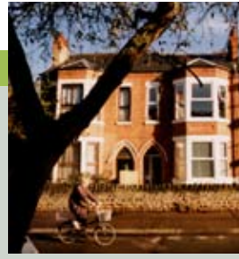
2000 Eco-house, Nottingham Private demonstration refurbishment of a Victorian Villa.