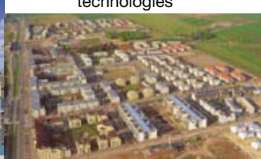
2000- SIBART network Large-scale (2000+) new urban extensions in Germany, Netherlands, Sweden, Finland and the UK with low carbon energy strategies