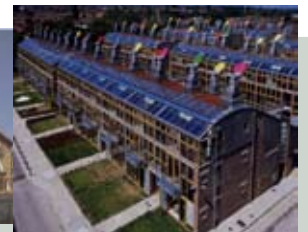
2002 Beddington ZED, London Pioneering super- insulated mixed tenure and mixed use housing project.