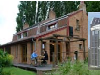
1989 Eco-house, Leicester Super-insulated, low energy demonstration home built as part of the City's Environment City project