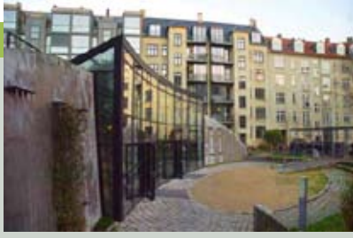
1990's Hebedygarde, Copenhagen Pioneering test-bed for turn of the century apartment blocks.