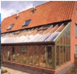
1994 Autonomous House, Nottingham Super-insulated family home which balances all its needs by generating solar heat and power