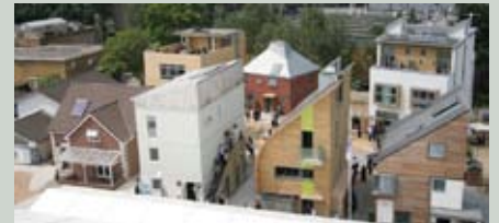
2005 – BRE Innovation Park Low and zero carbon house types by mainstream builders and construction firms.