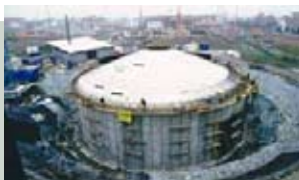
1996 Friedrichshafen, Germany Large-scale scheme which meets all its heating from interseasonal solar thermal storage.