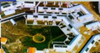
1992 Skotteparken, Denmark Social housing project with communal solar thermal and CHP.