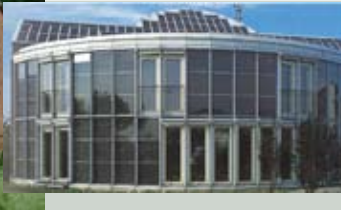
1992 Fraunhofer hydrogen house, Germany Family home which meets all its energy needs from solar produced hydrogen.